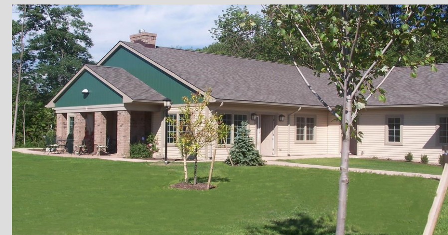
Thiel Hospitality House-Warsaw