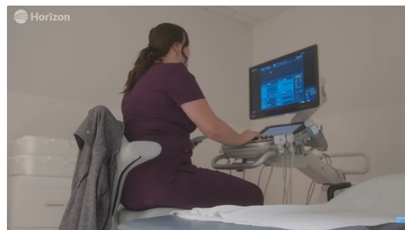
Click on the image for a day in the life of a Sonographer

https://www.youtube.com/watch?v=Mcl7_h4FmhE&t=28s