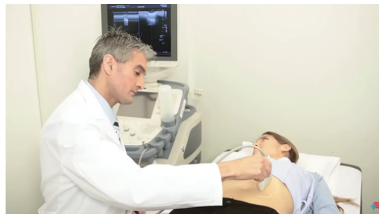
Click on the image for information on a career in Sonography

“Ultrasound is a great career path as it pertains to versatility and technology continues to advance.”